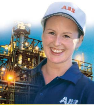
ABB is your partner: From consulting to project planning, from system installation to after-sales service.

Naturally, after any purchase after-sales services are just as important to you, as they are to us. That's why we offer you a broad spectrum of specialized services, such as: continuous maintenance, analyzer system modifications and troubleshooting etc. We'll be pleased to put together an individual service package for you.