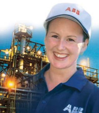
ABB is your partner: From consulting to project planning, from system installation to after-sales service.

Naturally, after any purchase after-sales services are just as important to you, as they are to us. That's why we offer you a broad spectrum of specialized services, such as: continuous maintenance, analyzer system modifications and troubleshooting etc. We'll be pleased to put together an individual service package for you.